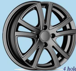
4 holes Titanium