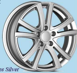
5 holes Silver

Have you already fallen in love with W091? Waiting for your feedback, we will come back to you soon with the first production details ;-)