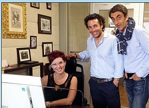
Ski Superchampion Giorgio Rocca in our office