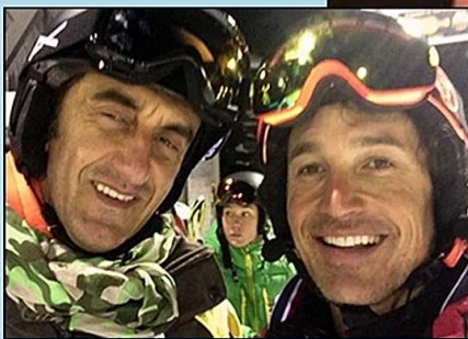
With Giorgio Rocca: Slalom World Cup Champion