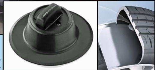
VDO REDI Sensor