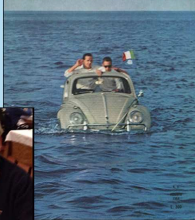
The car magazine Quattoruote dedicated the entire cover of its number August 1964 to the Messina Strait crossing mission.