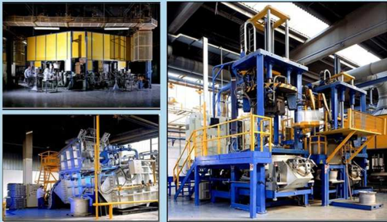
Fondmetal Casting Tools

After casting, the gravity-cast wheel can be processed immediately, while the wheels casted in low pressure could require a heat treatment process to give the alloy increased mechanical properties.