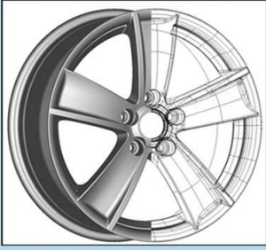
The 3D and the wire Frame drawings.