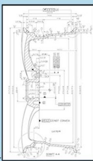
The 2D section of the wheel.

When the style is sketched, it is subjected to the proper authorities (Sales Dept. and Customer): the Technical Dept. makes the required changes (if necessary), and once approved, the project is confirmed.